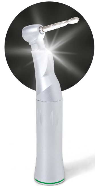
20 : 1 LED Contra Angle